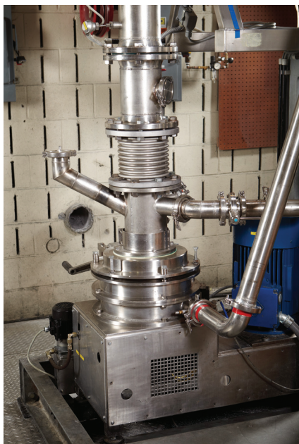
Recently developed cryogenic grinding mills can generate consistent yields of ultra-fine particles.