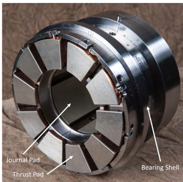
Figure 3. Combination journal and thrust tilting pad bearing.

The new offering incorporates adjustable inlet nozzles to increase the flow range. The inlet nozzles direct the flow of the process fluid into the expander impeller. By adjusting the throat or the distance between the adjacent nozzles, the flow through the expander can be controlled while maintaining the inlet and outlet pressures of