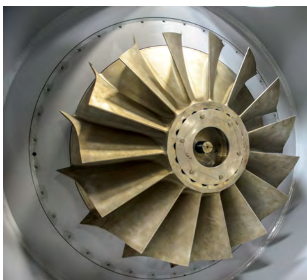
Figure 4. The Rotoflow product line provides cryogenic turbomachinery for refrigeration and energy recovery in a wide range of plants. This 16R has found its home in some of the world's largest existing liquefaction facilities.

the turbine. The nozzle position is typically controlled by the DCS via an electric actuator.